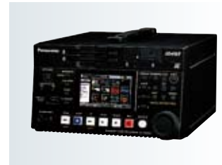
AJ-PD500 "P2 portable deck" Memory Card Recorder AVC-ULTRA and microP2 supported. A half-rack size recorder for a high- quality, cost-effective workflow