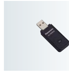
AJ-WM30 Wireless Module