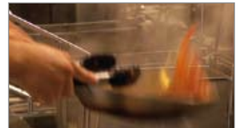
Undercranking (lower-speed shooting)