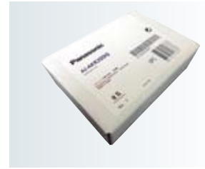
AJ-AKR200G Coming Soon Upgrade Software Key Enables AVC-Intra 200 codec recording. * Available in the near future.