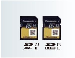
AJ-P2M064AG AJ-P2M032AG microP2 Card