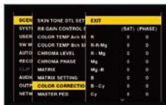
New image adjustment menu

Setting Items: H detail, V detail, detail coring, skin tone detail, chroma level, color temperature, master pedestal, knee, matrix, color correction, RB gain control, chroma setting, black control, gamma, high color, white clip.