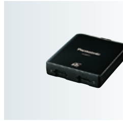
AJ-MPD1G "microP2 drive" Memory Card Drive Compact, lightweight, cost-effective USB-Bus powered microP2 card drive with USB 3.0 support and 2 card slots.