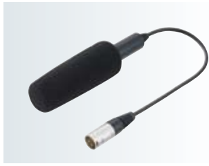
AG-MC200G XLR Microphone