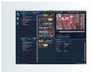
P2 Viewer Plus *2 Viewing Software Supports P2HD. This Windows/Mac utility makes it easy to view and copy P2 files.