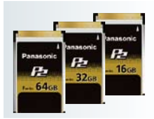
AJ-P2E064FG AJ-P2E032FG AJ-P2E016FG Memory Card "P2 card" F Series*1