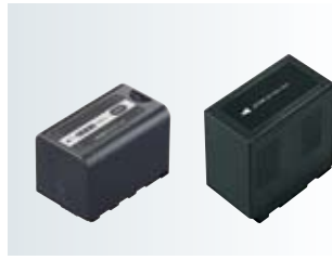
VW-VBD58 Battery Pack (5,800 mAh) CGA-D54/CGA-D54s Battery Pack (5,400 mAh)