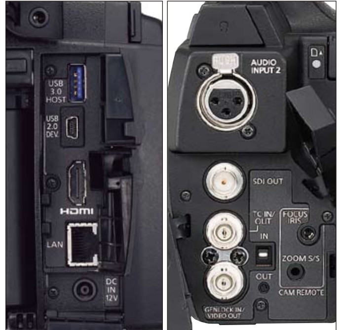
Rear Terminal (when cover is open)