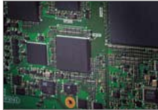
AVC-ULTRA Codec LSI

AVC Intra AVC-Intra using intra-frame compression method which is highly suited to image production. In addition to the conventional AVC-Intra100/50, AVC-Intra200 codec will be available as option.*1 Visually lossless images quality and superb 24 bit audio, it offers a level of quality that meets the needs of mastering or archiving.