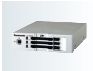
AJ-PCD30 "P2 drive" Memory Card Drive 3-slot drive with USB 3.0 interface for high-speed 1.5 Gbps data transfer.