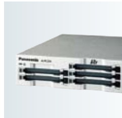
AJ-PCD35 "P2 drive" Memory Card Drive High-speed PCI Express interface.