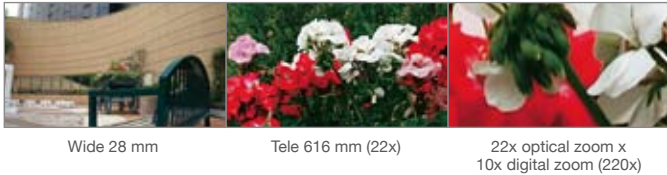
Wide 28 mm

The AJ-PX270 features a newly developed, high-performance, compact zoom lens. Zooming from 28mm to 616mm (35mm equivalent), this 22x zoom lens covers a wide field of view, from wide-angle to telephoto, without the need for a conversion lens. Combining 18 lens elements in 12 groups, this advanced lens unit further adds a UHR (Ultra High Refractive) glass element, a low dispersion element and aspherical lenses. This newest optical technology provides superbly high resolution. In addition, it is combined with our unique, Emmy awarded digital signal processing technology called Chromatic Aberration Compensation (CAC) to minimize color bleeding in the surrounding image areas and to achieve rich expression with finely rendered nuances and excellent shading.