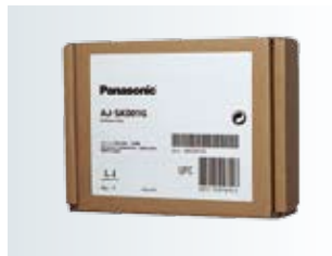
AJ-SK001G (for P2 Viewer plus) Ingesting Function Software Key*3 The ingesting function copies all clips on P2 cards to a storage medium, such as an HDD. During ingesting, the clips are verified for secure copying, with log files created.