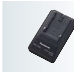
AG-B23 Battery Charger