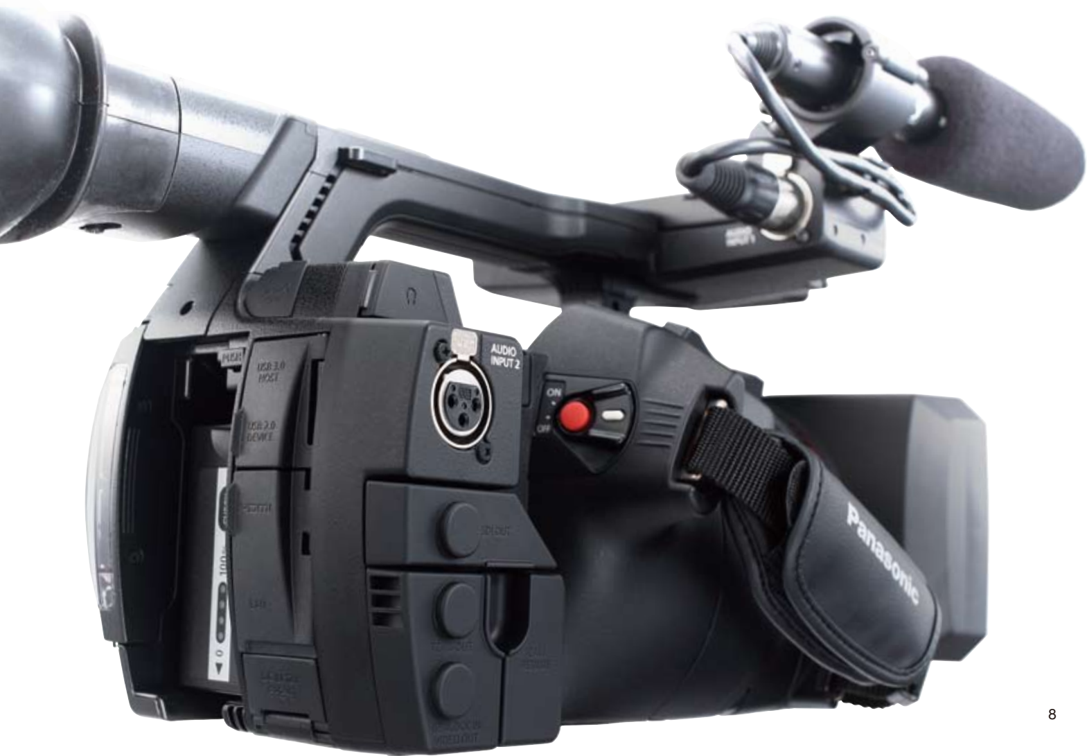
Side Terminal (when cover is open)