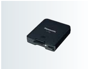
AJ-PCD2G "P2 drive" Memory Card Drive USB-Bus powered 1 slot P2 drive Ideal for mobile application.