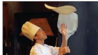
Overcranking (higher-speed shooting)